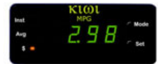
Trip Dollars Consumed